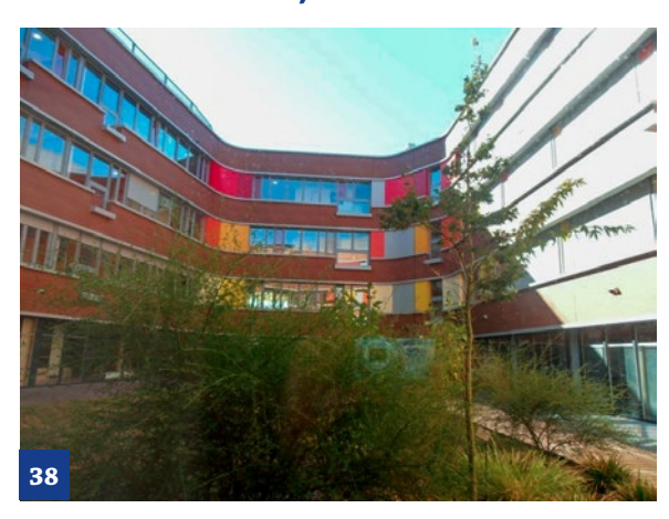
4.3.6 EHPAD Le Patio, Paris

This home, located in the suburbs of Paris, is run by a non-profit institution, specialises in elderly people with dementia. It has a capacity of 193 beds. The facility includes a special department for aggressive clients with dementia.