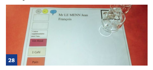
4.3.3 EHPAD<sup>32</sup> Vilanova Corbas, Lyon

✓ Individual table mats for clients – in the home's dining room, which they call a restaurant, special table mats are used with information on what the particular client wishes to eat and drink and in what order the meals are to be served. Moreover, these table maps facilitate the staff's work.